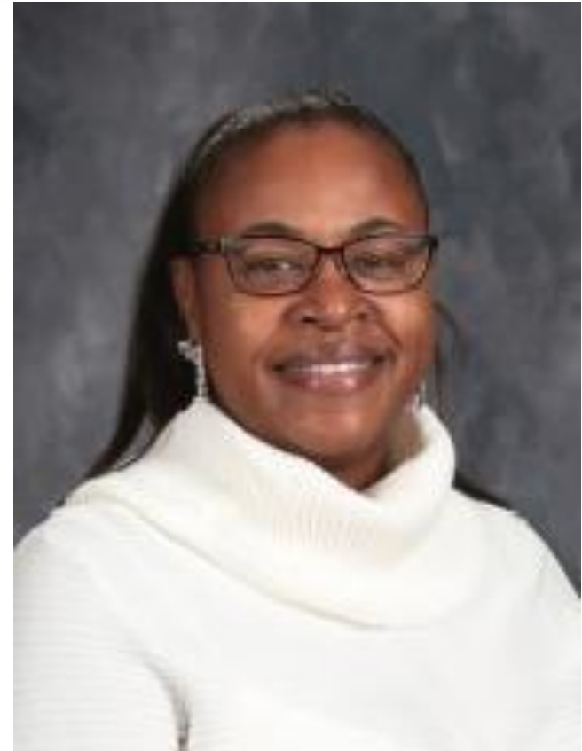
Pashion Muhammad Community Schools